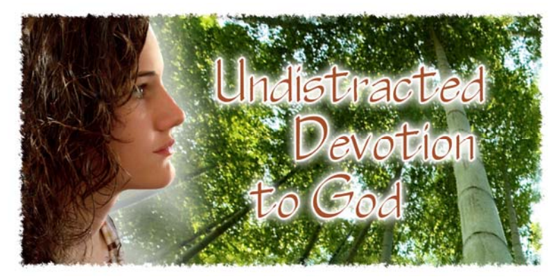
by Gina Magaruh

This I say for your own benefit; not to put a restraint upon you, but to promote what is appropriate and to secure undistracted devotion to the Lord.